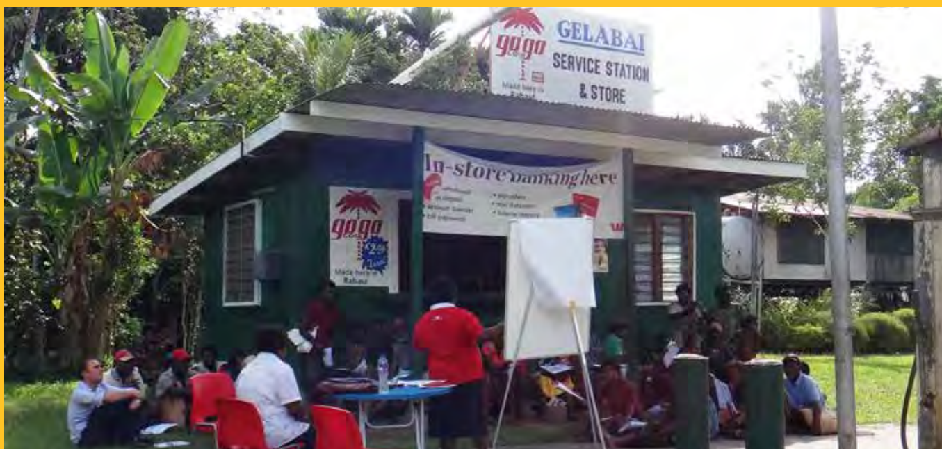
Gelabai In-store Banking branch, East New Britain Province

This commitment is part of the National Financial Inclusion and Financial Literacy Strategy that will be endorsed in early 2014 by the National Executive Council, with technical and financial assistance provided by the UN.