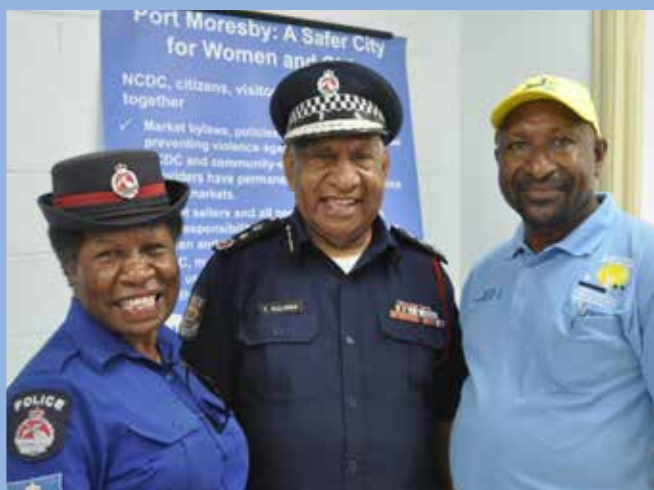
Gordons Market Police Unit Officer in Charge, Royal Papua New Guinea Constabulary Commissioner, and NCDC Market Management Division – Supervisor for Planning and Safe City Programme team member, Port Moresby

Since it began, the programme, in partnership with the National Capital District Commission, has made conspicuous impacts in Gerehu market in Port Moresby.