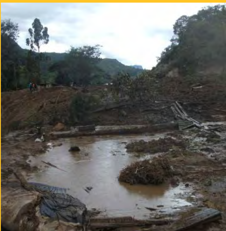
Aftermath of the landslide in Kenagi village, Eastern Highlands Province