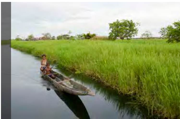
East Sepik Province, Momase Region

PNG first became a troop contributing country to UN peacekeeping operations in 2011. In 2013, PNG continued to send select defense force personnel to observe operations in Sudan and South Sudan. The government has stated its intention to increase troop contributions for future international missions.