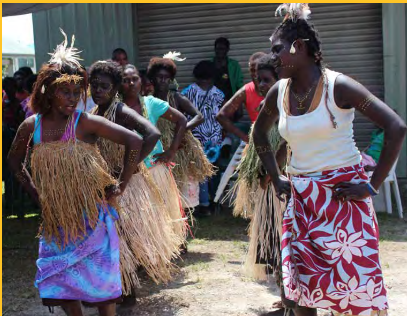
Celebration to launch the Family Support Centre in Buka, Autonomous Region of Bougainville

In 2014 the UN will continue to support national efforts to improve children and women's access to comprehensive services for survivors of violence.