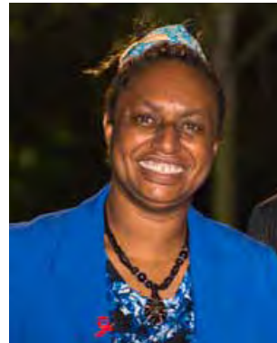
Pictured Left: The Minister for Youth, Community Development and Religion launches 'The Future We Want – Voices from the People of Papua New Guinea' on UN Day, 24 October 2013

development agenda. A comprehensive report, 'The Future We Want – Voices from the People of Papua New Guinea' was endorsed by the Prime Minister in 2013 and was officially launched by the Minister for Youth, Community Development and Religion at our UN Day event on 24 October.