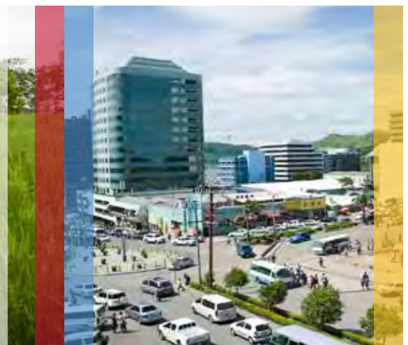
National Capital District, Southern Region