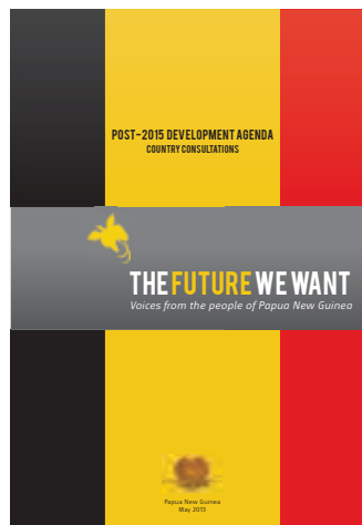
Pictured Left: The National Post-2015 Report: The Future We Want – Voices from the People of Papua New Guinea.

The results were validated at a technical level, followed by the political validation of government officials and development partners. The findings have informed the Country Report of PNG, which was endorsed by the Prime Minister in May 2013 and shared at the UN General Assembly in September 2013.