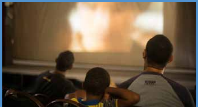
Audience members at the Human Rights Film Festival, Port Moresby

The organizing committee of the Human Rights Film Festival is led by the UN and comprises members and sponsors from the Government of Papua New Guinea, several UN agencies, development partners, NGOs, and the private sector. With 2014 bringing the 5th anniversary of the Human Rights Festival, this year's event aims to reach even more people, facilitating discussion and education about key human rights topics across PNG.