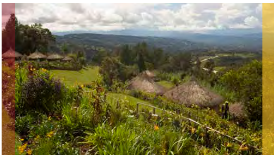
Hela Province, Highlands Region

PNG's MDG Progress Report (2010) reveals that the country achieved some of the country-tailored targets set in the Medium Term Development Strategy 2005-2010, particularly on MDG 1 (poverty reduction) and MDG 4 (child mortality), but did not achieve any of the internationally agreed MDG targets. It is encouraging that, since coming to power in 2012,