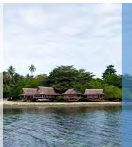
New Ireland Province, Islands Region