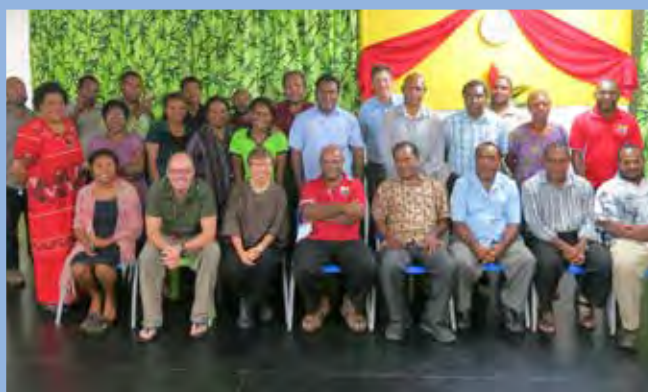
Field epidemiology trainees and their mentors, Port Moresby

The graduation ceremony for the first cohort took place in November at the NDoH in Port Moresby. After this successful first course, future FETP trainings are planned. The aim is that selected graduates from each cohort will be provided with additional training so they can serve as future FETPNG mentors and epidemiology leaders in PNG.