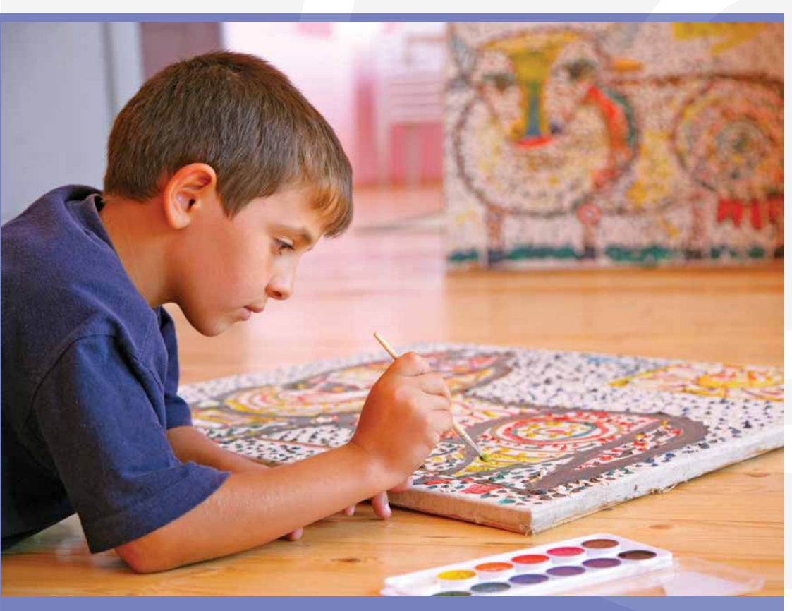
A boy who previously lived on the streets paints at the Umid Yeri ('Place of Hope') Children's Shelter and Rehabilitation Centre in Baku, Azerbaijan.

Young people need support and quality education to foster their potential as innovators.