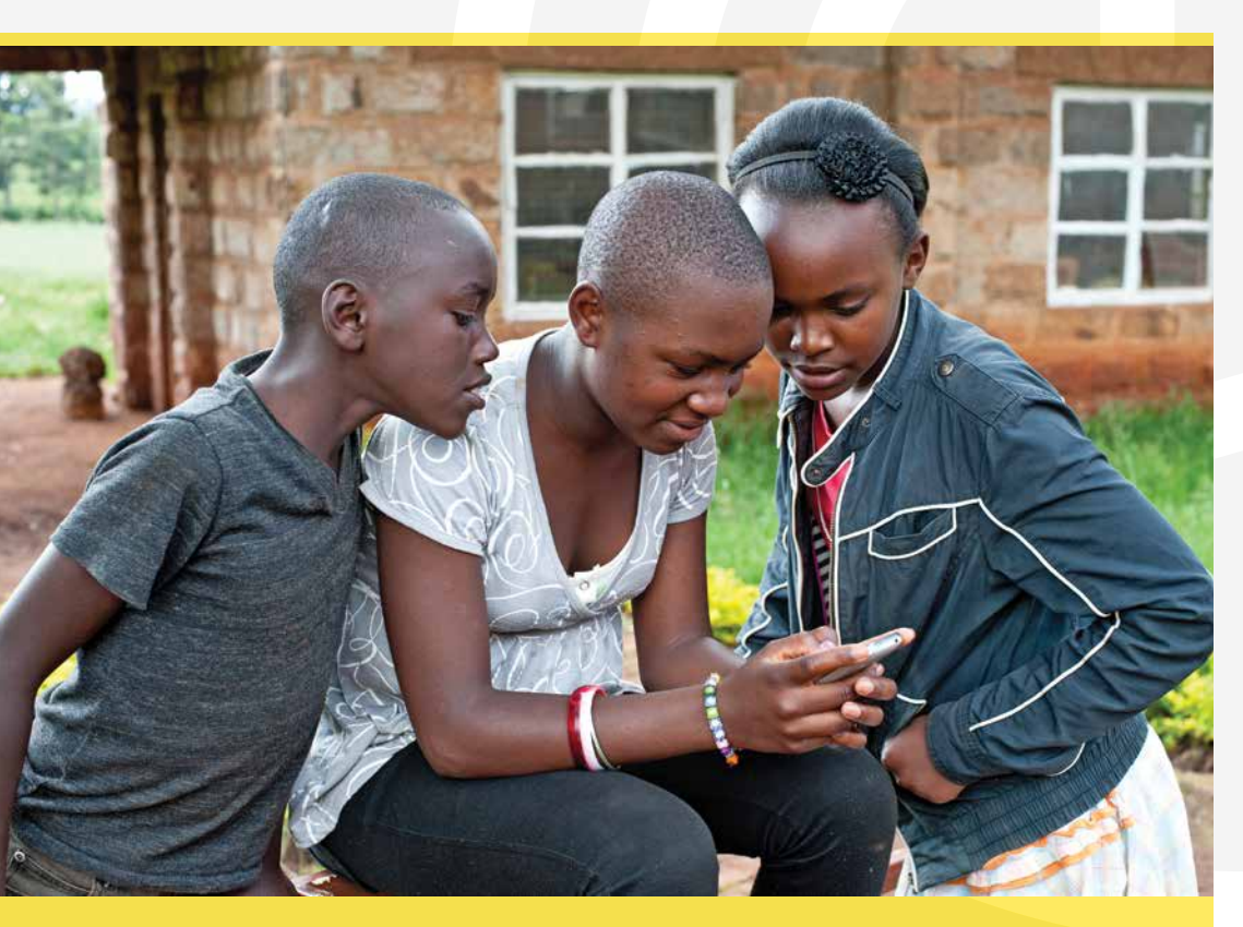
Affordable Internet-enabled mobile phones are allowing more Kenyans to go online.

Young people are finding new ways to participate and claim their rights.