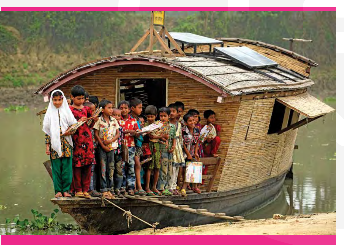
Architect Mohammed Rezwan developed floating schools as a way to ensure year-round access to education in flood-prone communities.