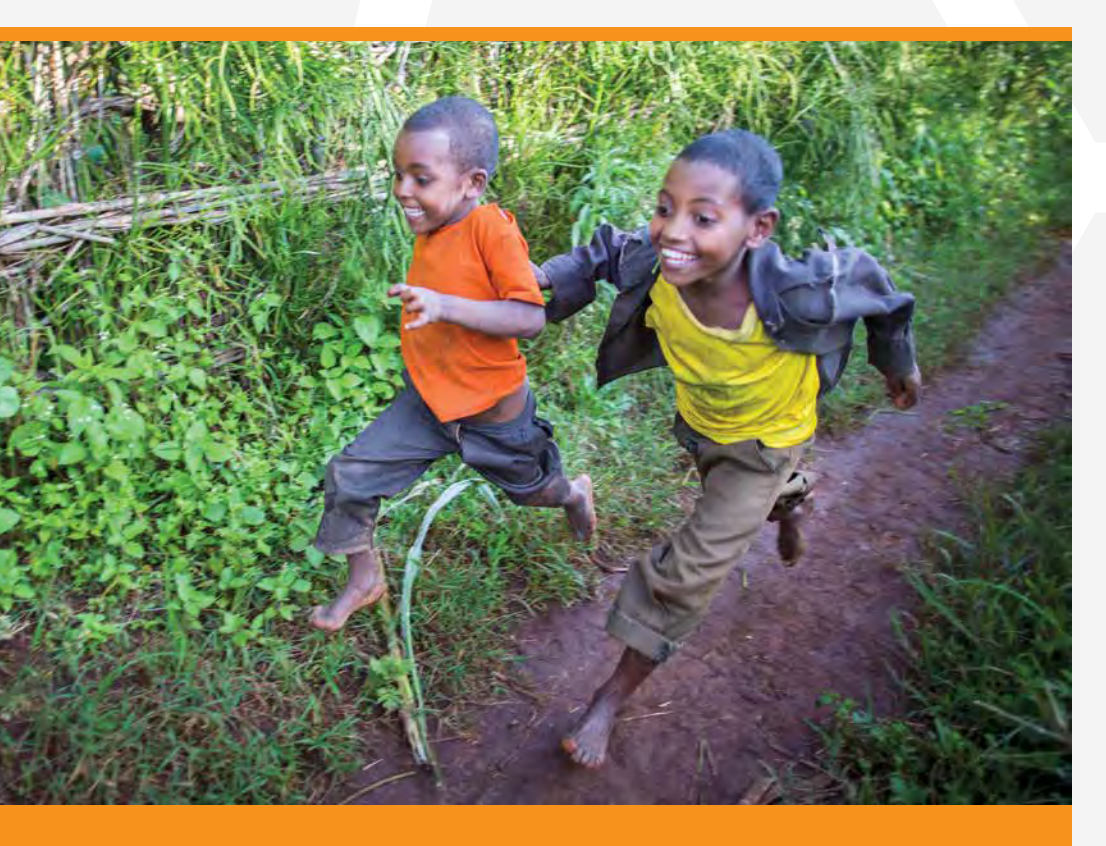
Children play near the Kitmbile Health Post in Oromia State, Ethiopia.

<a href="http://SOWC2015.unicef.org/topics/rethinkingstructures">http://SOWC2015.unicef.org/topics/rethinkingstructures</a>