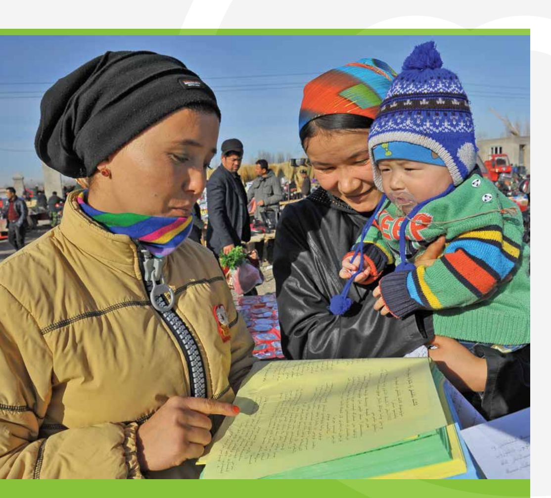
The Child Welfare Project in China uses community-based social workers to reach poor and remote children in a cost-effective and efficient way.

Inclusive and sustainable solutions, by and for local people, are emerging.